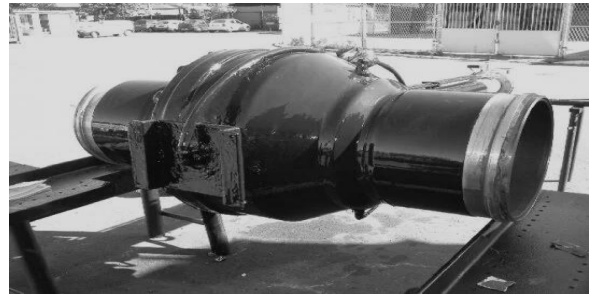
Figure 2. Application of the "Protegol" Anti-Corrosion Coating by Germany's TIB Chemicals Company

By addressing these issues, the research aims to develop a comprehensive set of strategies to protect the marine environment and enhance the sustainability of offshore pipeline operations. In doing so, the study will contribute to ongoing global efforts to balance the development of energy infrastructure with environmental responsibility.