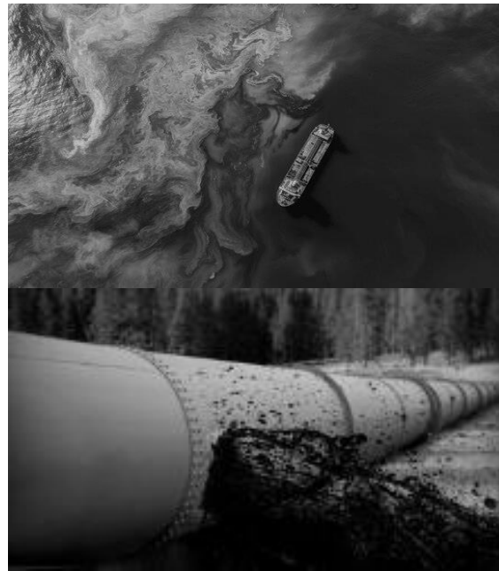
Fig.1. Pipeline Leakage and Marine Aquatic Pollution.

Solution to the Problem: Considering the unresolved issues mentioned above, the aim of this research is to investigate, analyze, and propose effective solutions to strengthen environmental protection measures in the operation of subsea pipelines. The research aims to address the following key objectives: